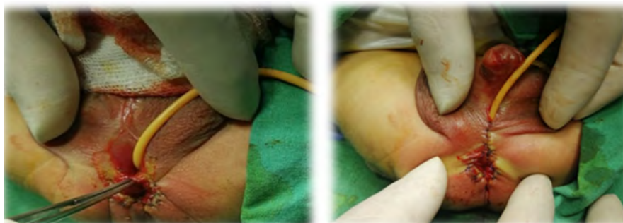
Figure 1: a: appearance after opening meconium line, b: simple anoplasty and simple perineal hypospadias closing

The child now is 4.5-year-old (Figure 4). Urethral stone (simple anterior urethral stenosis) was managed before 8 months by cystoscopy and laser.