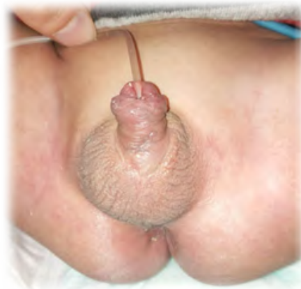
Figure 4: The last appearance