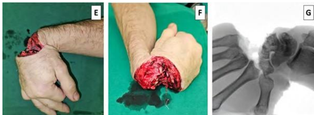
Figure 3: Intraoperative clinical images (E, F) and an intraoperative radiograph (G) collectively illustrate the impact of a traumatic injury, exposing a subtotal amputation of the right hand.