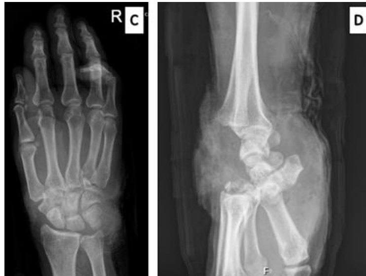
Figure 2: (C) In the posterior-anterior (PA) radiograph of the right wrist, fractures in the 2nd row of the wrist bones of the right hand are apparent. (D) The lateral (LL) projection showcases a complete dislocation of the II-V metacarpal bone in the dorsal direction with fragments of the metacarpal bones, along with subluxation of the I metacarpal bone dorsally.