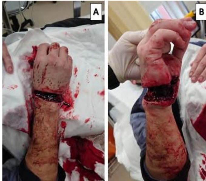
Figure 1: Preoperative Clinical Image. Anterior (A) and lateral (B) views reveal a subtotal amputation at the right hand's wrist level, with apparent venous stasis. Remarkably, feeling in the fingers is preserved despite the severity of the injury.