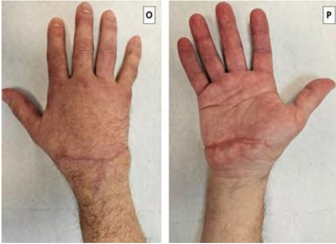
Figure 7: Six months post distal carpectomy Dorsal surface (O) and palmar surface (P) of the patient's hand.