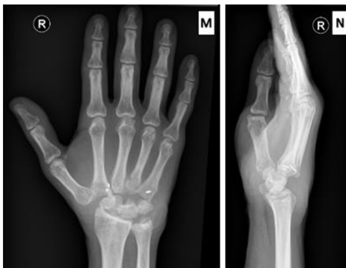
Figure 6: Six months post-surgery showcasing patients wrist (M) the PA projection and (N) the lateral projection.