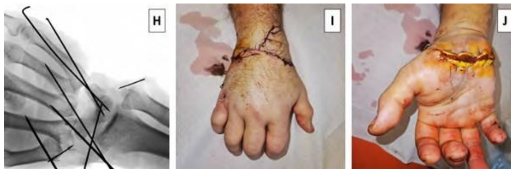
Figure 4: (H) Intraoperative radiograph demonstrates the implementation of Kirschner wires for securing MKK (I, II, III, IV, V) to the bones of the proximal carpal row. (I, J) Postoperative images reveal the right arm of the patient following surgery, just before the cast is applied for immobilization.