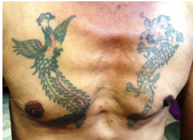
Figure 3: Clinical picture of the patient's chest demonstrating the skin tattoo over the upper inner breast region. The distribution of the tattoo closely follows the distribution of microcalcifications on the mammographic images.