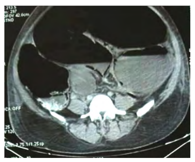
Figure 3: Axial scan section showing the "bird's beak" appearance.