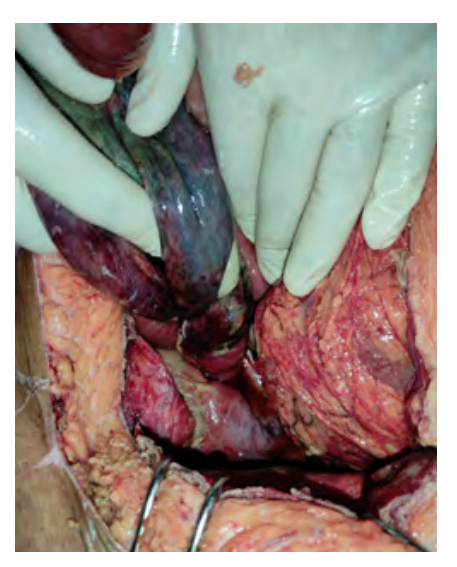
Figure 5: Clockwise turn of coil with sigmoidal necrosis