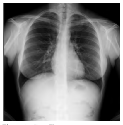
Figure 1: Chest X-ray

Although the images were not suggestive of a hydatid cyst, it was considered as a differential diagnosis because of its high prevalence in the local population. A new blood test was performed including Echinococcus granulosus, Hep B, HIV, serology and tumor markers (CEA, Ca 125, Ca 19,9, Ca 15,3, AFP). The only positive result was a slight elevation of Ca 125 (38U/ml, cut off value 35). A transvaginal ultrasound was also performed and was normal.