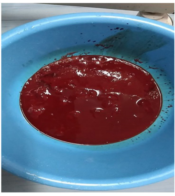
Figure 1: Large volume hematemesis

Laboratory results were as follows: WBC=13.9x 103/mm3, RB-C=4.5x 106/mm3, HGB = 9.5g/dl, PLT =459x 103/mm3.Abdominal ultrasound was normal. Liver and kidney function test were normal. Biopsy taken in stomach excluded H pylori infection. Antigen of H pylori in stools resulted also negative. After 5 days of omeprasole iv we discharged him with oral omeprasole at home. Five days later he was rushed to emergency room because of large volume hematemesis (Figure 1). Hgb level was 4 gdl. He was pale and peripheral pulses were very weak. After an emergency transfusion he was send immediately to surgery for intervention. During duodenotomy was noticed a deep ulceration (Figure 3). This zone was resected and later was performed an anastomosis between stomach and duodenum (Figure 4). Follow up was uneventful