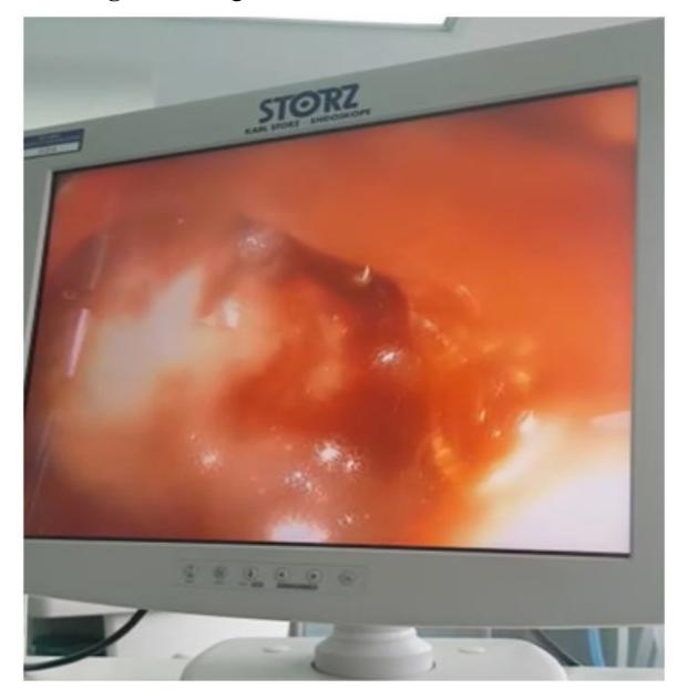
Figure 2: An ulcerative mass after pylorus during upper endoscopy