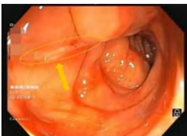
Figure 1: The first colonoscopy after the onset of the disease.