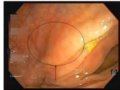
Figure 3: The colonoscopic and endoscopic manifestations after 3 months of treatment.