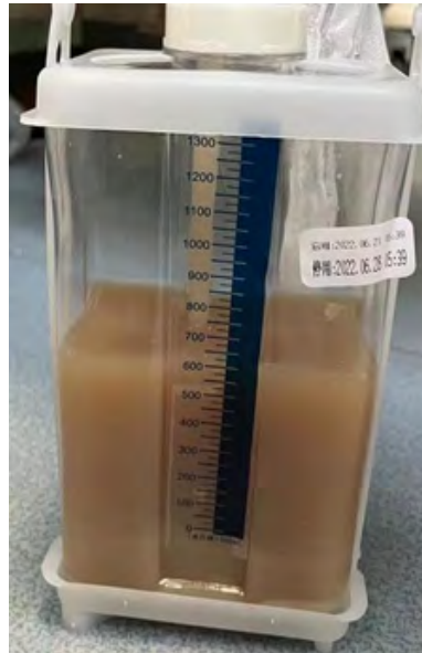
Figure 2: Closed drainage of yellow-green foul-smelling pus from the chest cavity.