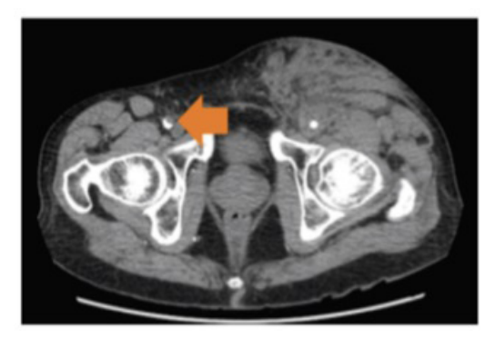
Figure 3: CT scan showing subtotal occlusion of right CFA.