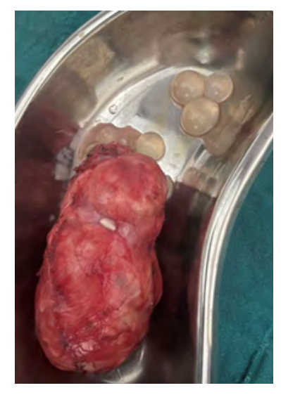
Figure 1: A hydatid cyst measuring 20 x 15 cm containing numerous daughter cysts.

Histopathological examination confirmed a hydatid cyst. After the final diagnosis of hydatid cysts originating from the para-spinal muscles of the upper back, the recovery from surgery went smoothly. The patient is doing well and there has been no sign of a recurrence during the six-month follow-up period (Figure 2).