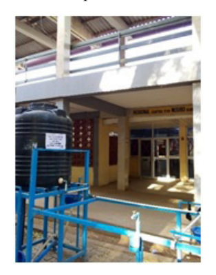
Figure 3: Hand washing gadgets for patients at the entry gate of Neurosurgery centre.