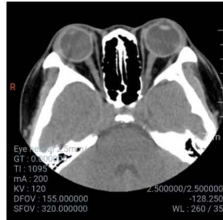
Figure 3: The image photograph of orbital CT on the plane of optic nerve.

block. The level of TSH was 12.202 mIU/L (the normal level was 0.56~5.91 mIU/L). The level of blood sugar and the examination of brain MRI were normal. And the tension test was negative. In conclusion, the diagnoses of the patient were KSS, TAO and hypothyroidism after hyperthyroidism treatment.