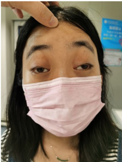
Figure 1: The frontal appearance of the patient.

The best corrected visual acuity was 16/40 and 4/40 respectively and the intraocular pressure was normal. The proptosis of both eyes measured by Computed Tomography (CT) was 20mm. Besides, the upper eyelid of both eyes covered about 4mm below the upper corneal margin when she saw forward (Figure 1). The muscle strength of the elevator palpebral was 1mm and eyelid could be closed completely. Anterior segment examination was normal. We found that the edge of the optic disc was clear but the retinal arteries were small and a massive of pigmentation could be seen in the posterior pole and surrounding of retina (Figure 2). The left eye was in an external oblique position which caused the optic disc could not have been photographed. The corneal reflection test of right eye was normal but the left eye was about -15\Delta . Both eyeballs were in a fixed position and the movement of them in all directions was limited.