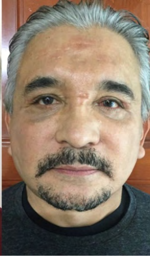
Same view. Post-op Patient